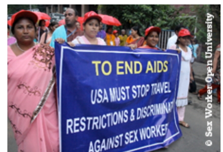
Sex Worker Freedom Rally

Michel Sidibé, UNAIDS Executive Director, in his message to the IAC Hub, described the Freedom Festival “a wonderful example of people who face stigma and discrimination speaking out and taking control” adding that a “major obstacle to reducing HIV is the fact that sex workers and people who use drugs are systematically discriminated against and criminalised... and there is NO evidence to suggest that such laws reduce demand for sex or (reduce) the number of sex workers.”