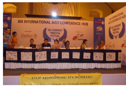
SWFF panel – Kolkata