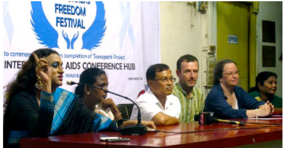
Sex Worker Freedom Festival Press Launch – Kolkata July 2012

US government travel restrictions for sex workers meant that many sex workers were not able, or not willing to go to the IAC in Washington this year. The Sex Worker Freedom Festival was an alternative event for sex workers and our allies to protest our exclusion and ensure the voices of those excluded were heard in Washington.